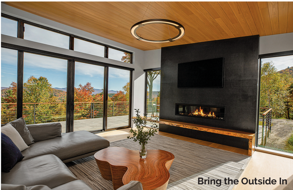
Bring the Outside In

FROM TOP: A Volansky Studio Vermont Mountain Modern home features elemental materials like wood, steel, and stone that mesh harmoniously within the natural environment. Floor-to-ceiling windows create a seamless sense of connectedness with the outdoors. A maple leaf, serendipitously placed by Mother Nature, leaves a whimsical ode to nature in the artisanal concrete floor.